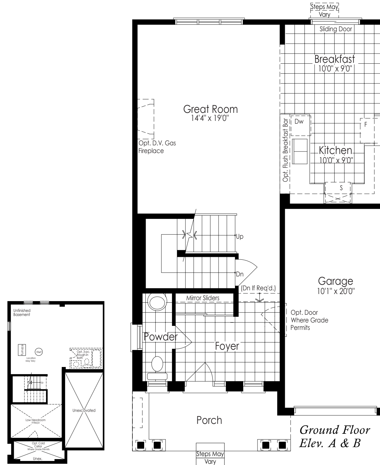
Basement Elev. A & B